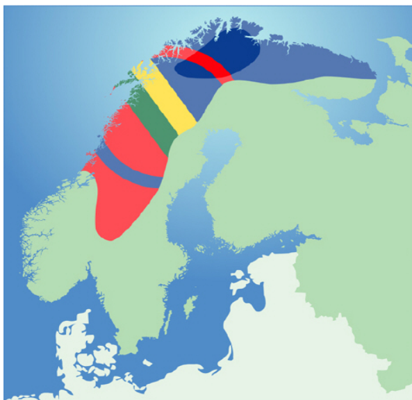
Figure 1. Sápmi covers part of four countries according to the Norwegian Sámi parliament

The Sámi rights commission admits only that probably the core area of the Finnmark plateau must be considered as belonging to the Sámi according to this paragraph. The arguments of the Sámi parliament are neither very clear nor consistent. Sometimes it sounds as if more than half of Norway and the Barents Sea must be considered to be lands they traditionally have used and depended on.