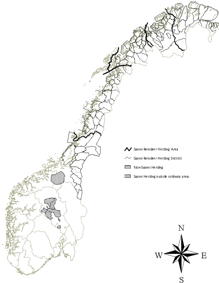
Figure 3 Reindeer herding areas (Berge 1998:8)

Thus there is at least some historical connection between the map of Sápmi and the idea that these are the lands they traditionally occupy.